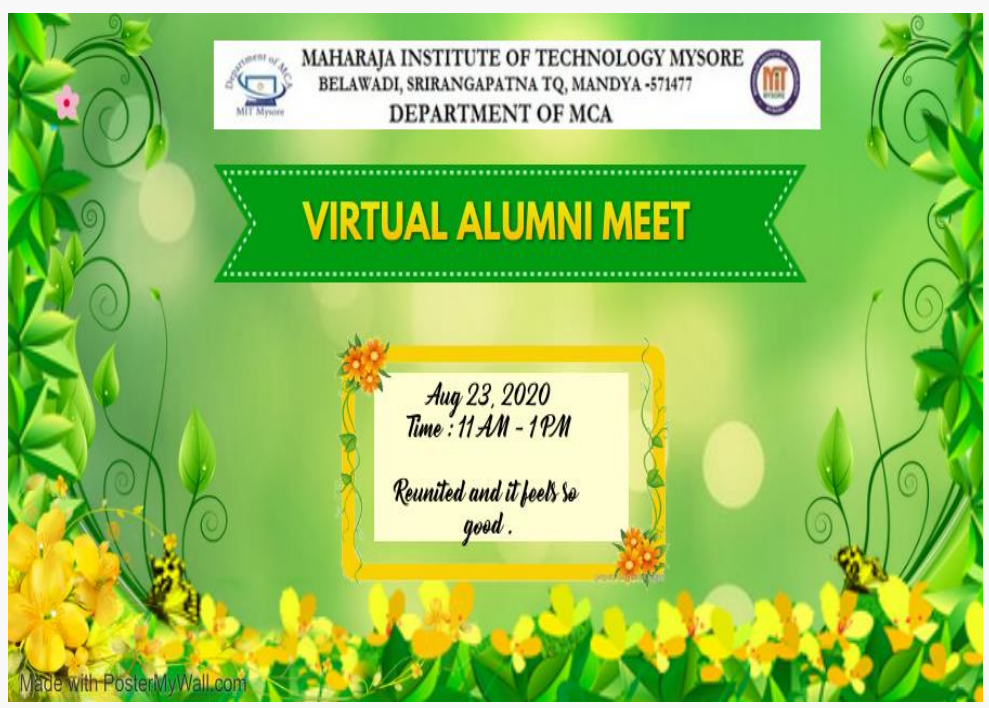
Alumni Meet Invitation Poster