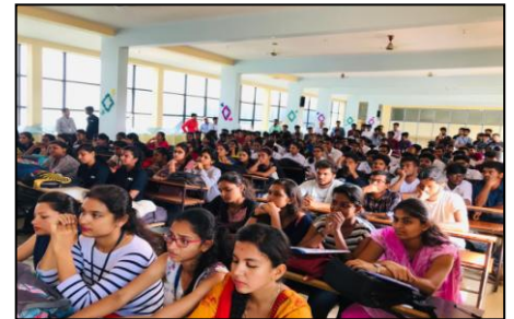
Picture 2, 3 & 4: From L – R, Participants in Quick Build, Finalists of the Short Cricket, The gathering during the inaugural function.