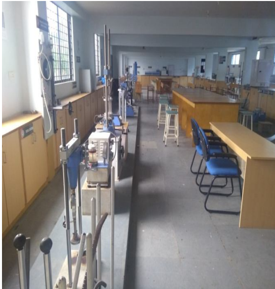
Geotechnical Engineering Laboratory