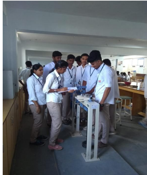
Geotechnical Engineering Laboratory