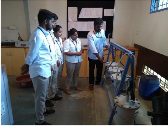
Concrete Permeability Apparatus