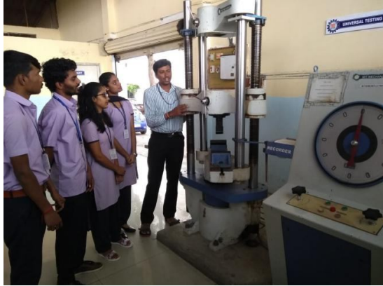
Building Material Testing Laboratory