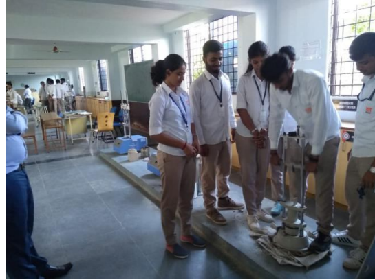
Building Material Testing Laboratory