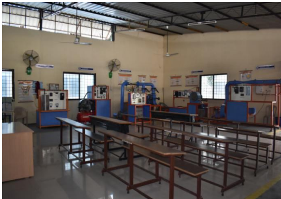
Fluid Mechanics Laboratory