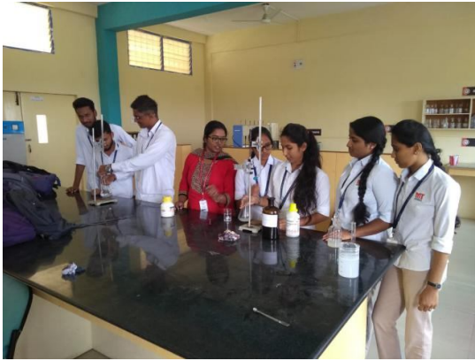
Environmental Engineering Laboratory