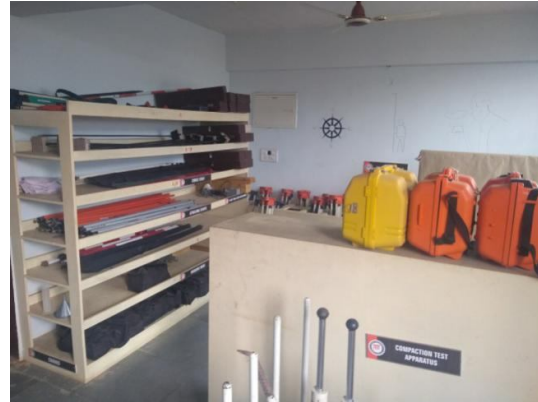
Basic Surveying Practice Laboratory