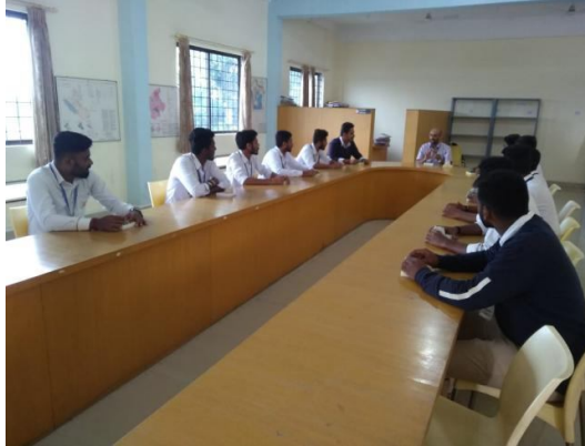
Engineering Geology Laboratory