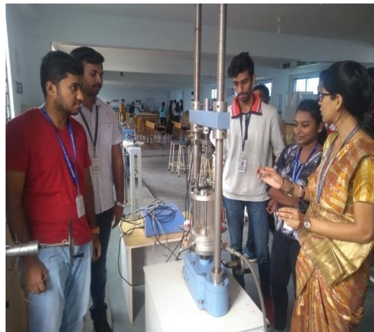
Digital Tri-axial test apparatus