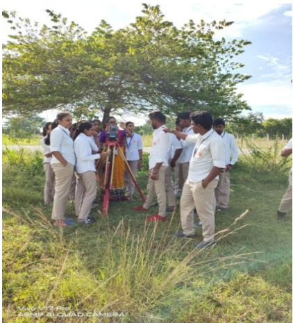
Total Station Practice