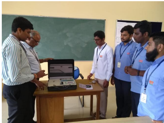
Water Testing Kit