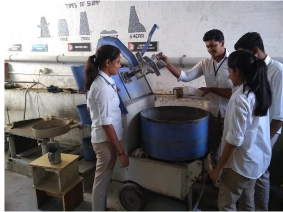
Concrete and Highway Material Laboratory