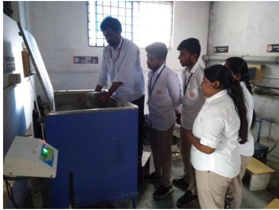
Accelerated Curing Tank