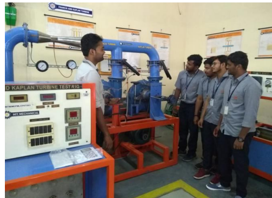
Fluid Mechanics Laboratory