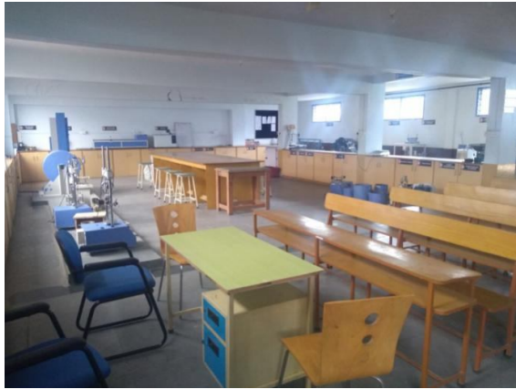
Concrete and Highway Material Laboratory