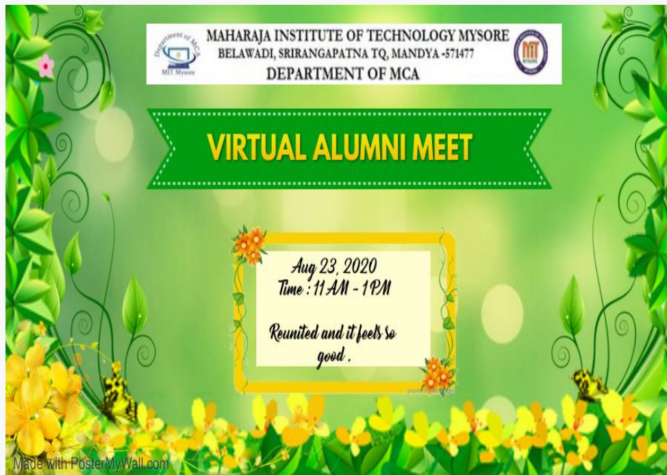
Alumni Meet Invitation Poster