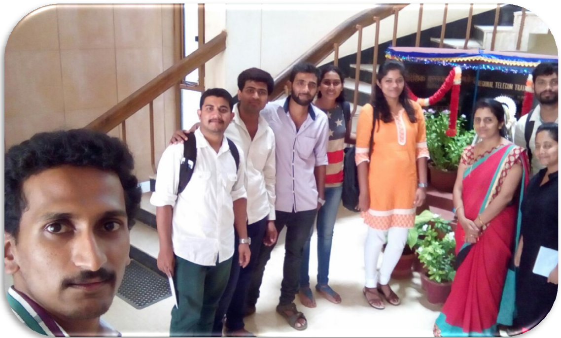
Students at BSNL Communication Center

Department had arranged a industrial visit to BSNL Communications branch in Mysuru on 6 th September 2016. The main intention of the visit was to bring awareness about Wireless Communication.